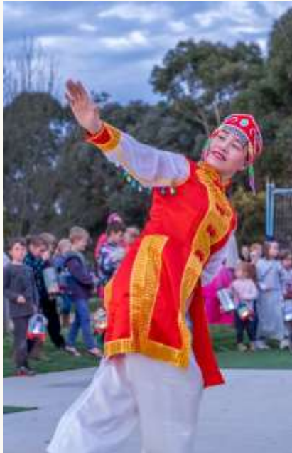
A dancer from Ballarat's Chinese Australian Association