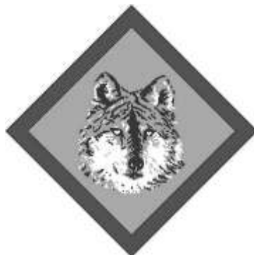
Cubs: Grey Wolf badge