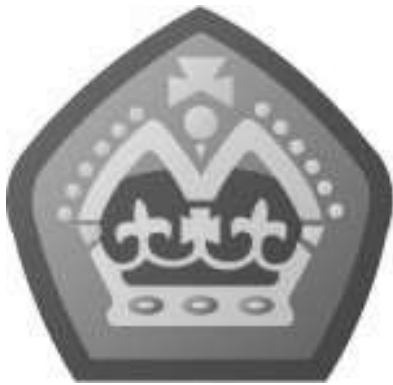
Venturer: Queen Scout badge

For more information: https://scoutsvictoria.com.au