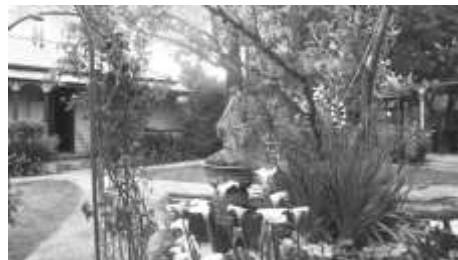
Ophir Cottage Garden

Marg Giles – 0419 326 453; Sandy Jennings – 0405 717 321