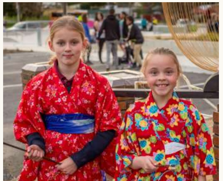
St Augustine's Primary School Students in Japanese national costume.