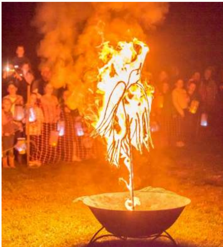
See more photos on page 11