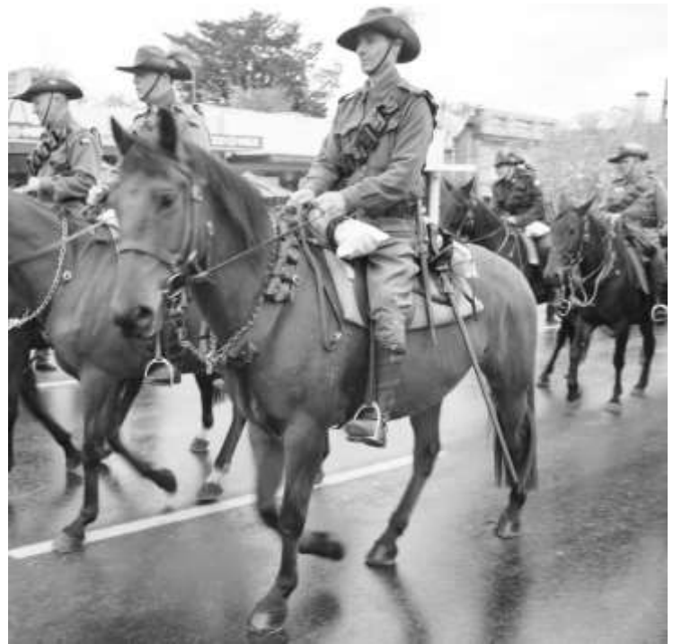
Members of the Creswick Light Horse Troop at a recent ANZAC parade